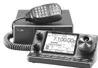
IC-7100 All Mode Transceiver