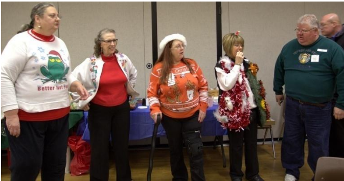
2014 Holiday Finery