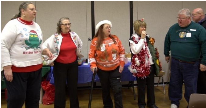
2014 Holiday Finery