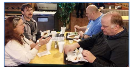
After the meeting, the Public Service Committee met at the Cedar River Smokehouse restaurant to discuss the 2013 Amateur Radio Information Guide, typically released in early March.