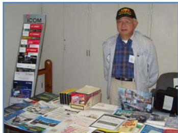
'Toku' – AD7JA