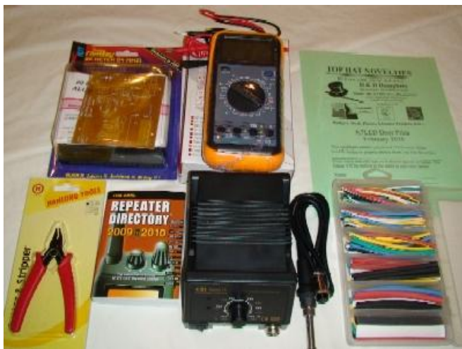
Photo: These door prizes await you at the Club's February 20th General meeting .

This month we offer some door prizes that have been popular in the past. They include a temperature-controlled solder station with analog control, a custom membership badge, a Ramsey HR20C 20 meter all mode receiver kit, a 2009-2010 repeater directory, a digital multi-meter, an assortment of heat shrink material, and a handy little wire cutter.