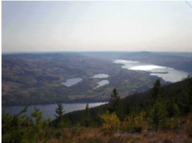
A view from the Lake Chelan Club repeater site.

Lake Chelan Radio Club... [Continued from Pg8]