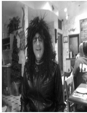
Twin 1 -- Somewhere else Twin 2 -- in SeaTac

Someone was quoted as saying "Ozzie looked like he needed his hair combed last night."