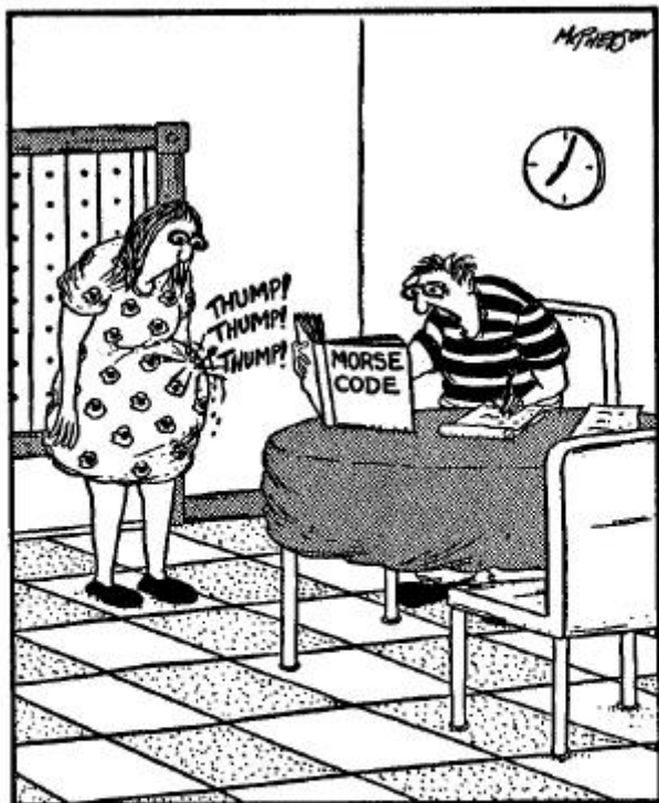
"The baby just said, 'Don't even think of naming me Trevor!'"

Sunscreen, bug repellent, warm clothing, rain gear, extra blanket, flashlights, handi-talkie, spare batteries (don't forget extras for your HT too), food and snacks, ice, drinks, pot-luck dish for Friday night, camping gear (if needed), matches, first aid kit, XYL, and the rest of the family.