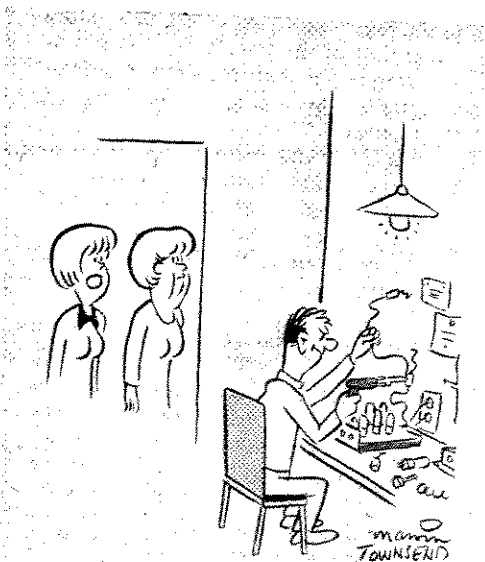
No matter what the project he's working on is supposed to be—it ends up being a light dimmer.

To Treasurer-$350 for Banquet-Men's Prizes from Raffel.