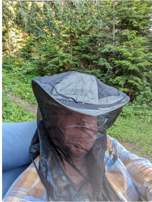
Yeah - not approved by my image consultant, but there were insects...oh yes there were