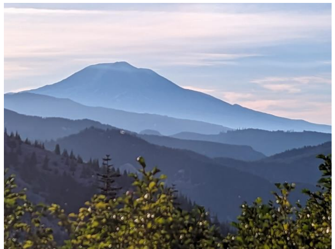
Mt Adams from Windy Ridge Aid Station

I was at Windy Ridge Aid Station for the first couple of days.