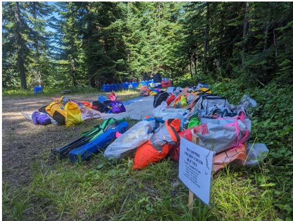
Runners pre-pack bags to be available with fresh socks, shoes, whatever at the Aid Station... highly organized by bib number...