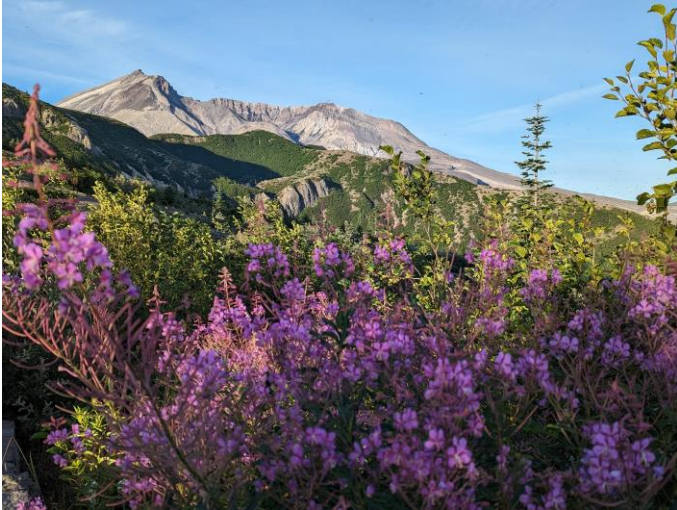
Mt. St. Helens evolving after the 1980 eruption. Lookin' up into the crater and the lava dome

Runners wear SPOT Satellite transmitters so we can see who is coming on/off course. We mostly were connected to the outside world with our radios, antennas, solar panels, and batteries.