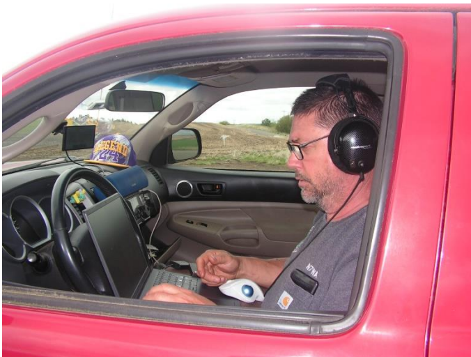
Nez Perce/Latah county line in Idaho

As I mentioned, I was also anticipating just getting out of the house for a weekend out on the road. That part went very well and I came back mentally refreshed if physically exhausted.