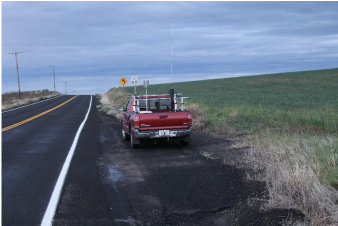
First stop Yakima/Klickitat county line, 6AM start