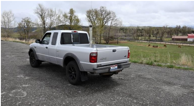
K7TQ/m lunch break in Powell County, MT

The rig was an Elecraft KX2 and an Elecraft KXPA100 to a Scorpion 680 antenna mounted in the center of the bed of my 2002 Ford Ranger. We used N1MM+ on an HP laptop with full rig control and a MORTTY for CW keying.