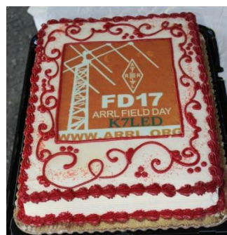
Field Day Cake brought to the potluck by K7TQ

If you have a gmail account, you can add your own pictures and/or comments. All are downloadable. Feel free to share the link.