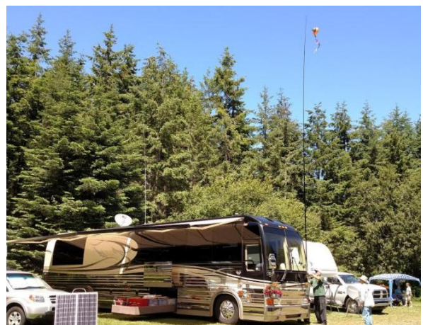
The QRZ land yacht, snuggled into its space at the Wagon Wheel. Note vertical antenna on rig's LF corner.