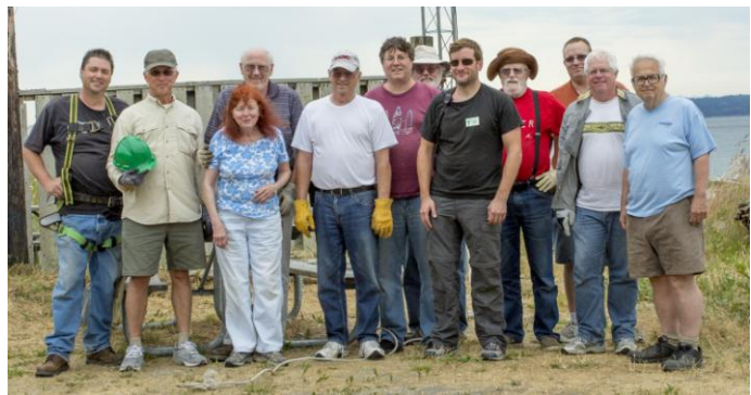
CW Beach Teardown Crew