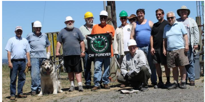
CW Beach Setup Crew

Sometimes it is hard to get up the gumption to get ready each June but it never fails to inspire me when I actually arrive.