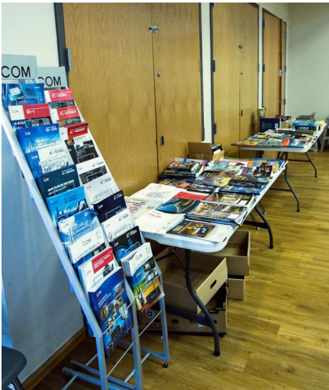
Typical Library offerings at the Club Meeting

http://www.skywaytv.net/ Please come by and browse!