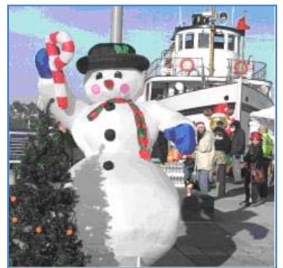
Steamer "Virginia V" awaits her "Special People" guests at the Naval Reserve dock.

Their eyes were sparkling; their voices were excited, as they arrived at the Naval Reserve dock and yacht clubs and marinas around Lake Union and Lake Washington. Hundreds of developmentally disabled guests and their helpers, family and friends excitedly awaited the Captains' hails to come aboard the awaiting boats for the annual Special People's Holiday Cruise.