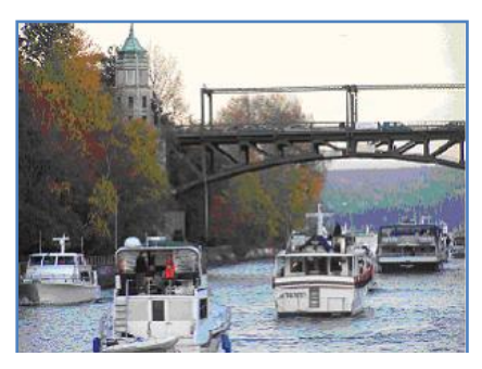
Cruise boats passing under the Montlake Bridge.

holiday-decorated and lighted homes along the shoreline. Near the eastern shore the boats rounded a lovely old two-masted wooden sailboat, where Santa greeted each vessel and guest, while Christmas carols drifted on the chilly air. Sponsored by SEAFAIR and 'Union-76' gas stations and others, this unique