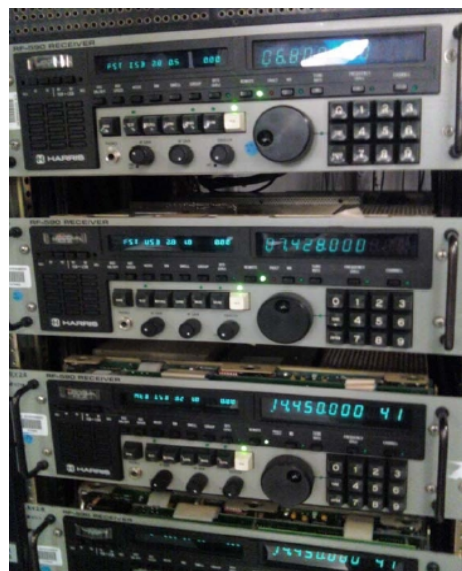
Photo: Two Harris receiver system pairs, each capable of monitoring .5 MHz to 29.999 MHz.

They can operate on their choice of about 80 different HF channels. A table of those frequencies follows this article. You can monitor them during an emergency if you have general purpose receive capability.