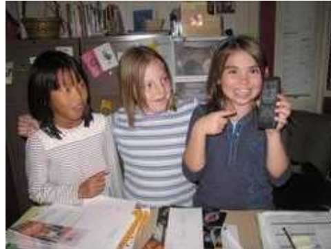
Photo: Three students at Garfield Elementary School in Boise, Idaho play "Where's the Remote?" in preparation for a QSO with the International Space Station. (End of ARRL Newsletter Excerpt articles)

integrating the activities into each grade level's curriculum. The lesson in common to all schools includes discussions on what Amateur Radio is, what ARISS is and how the worldwide ARISS Team works together. Click here to read about how one elementary school in Idaho integrated Amateur Radio, space -- and more -- into their curriculum.