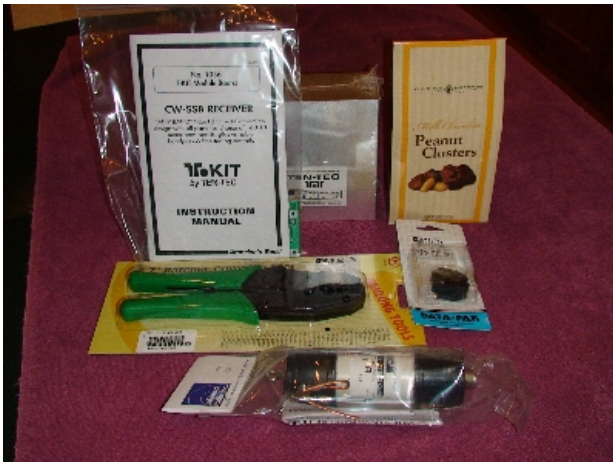
Photo: These November door prizes await you